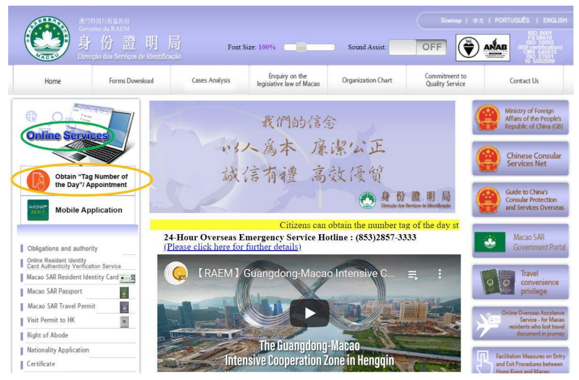
Citizens can use online channel to obtain the number tag of the day, make appointment or lodge application.